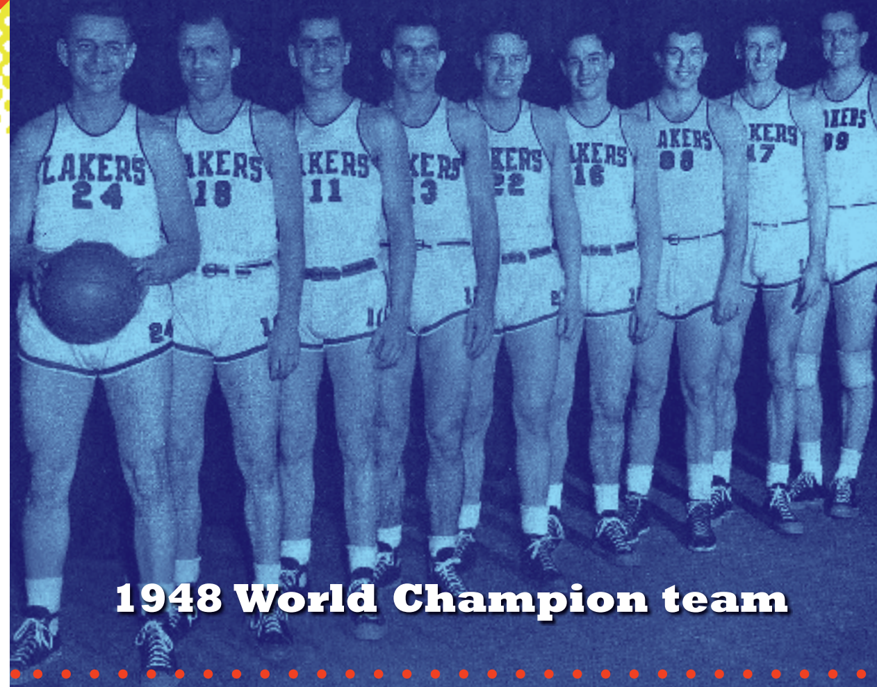
1948 World Champion team

The Los Angeles Lakers became a team before the NBA formed. The team started in 1946. It played in Detroit as the Gems. The next year, it moved to Minnesota. The team's name changed to the Lakers. The name honored Minnesota's many lakes. The Lakers moved to Los Angeles in 1960. And it's been winning ever since. The Lakers has won 16 championships.